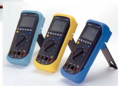
Other color choices for Holster

Shock absorbing holster add an extra protection and provide a built-in tilt stand.